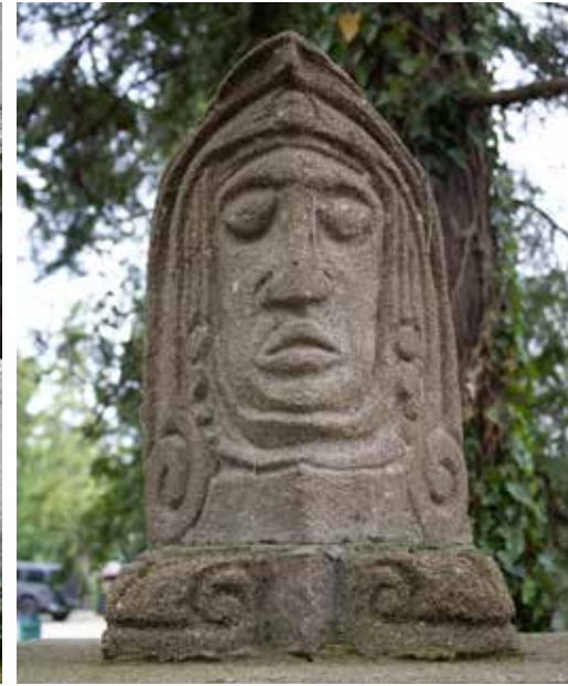
Sculpture welcoming visitors to the site