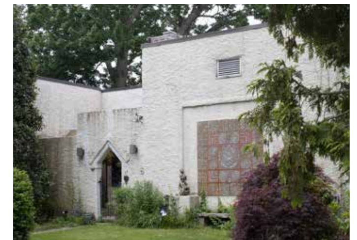
Front of the Banca residence