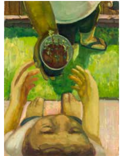
MJ Torrecampo, Propagation , oil on canvas