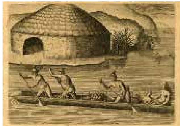
This engraving of the Timucua by Theodor de Bry shows some accurate information, but the artist also took many artistic liberties. We will be exploring these issues further in the exhibition.