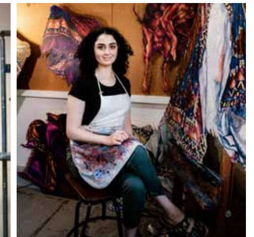
Mär in studio