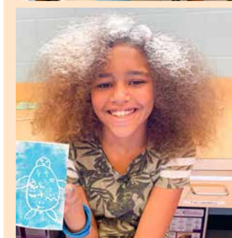
Printmaking for All workshop participants