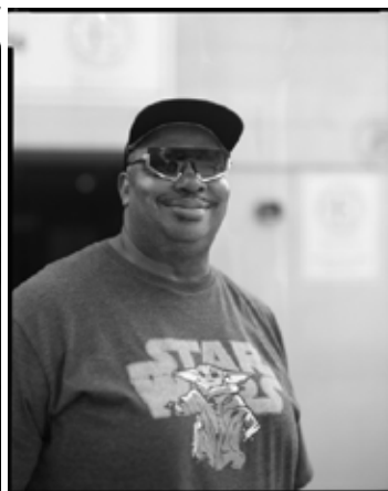
Millard, Eatonville, FL