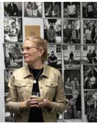
Artist in Residence's studio