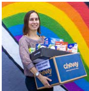
Dropping food donations off at the LGBT+ Center Orlando, collected by A&H staff