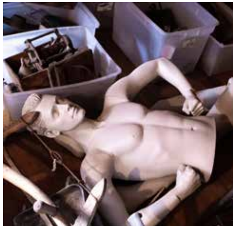
Behind-the-scenes: sorting through the collection and displays in storage

The story of Maitland isn't a story of time, however. It's a story of people, seemingly ordinary people, who lived through extraordinary times. It's the story of people who labored here, raised their families here, who loved, lost, thought, and created here, even as the world changed around them. We look forward to welcoming you to Maitland's Attic, a gathering place of the unique items that the people who came before us held dear. From the everyday to the downright weird, these objects open a window onto the people who chose to call Maitland home.