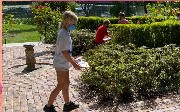
Students looking for materials & inspiration outside our Cottage at Lake Lily

Workshops are offered for students from elementary through high school, and this year's workshops will be taught by local professional artists, including A&H's own Artist-in-Action Damon DeWitt. In addition to the Creative Explorations series, students will also have the opportunity to learn more about a variety of artistic mediums, including pottery, mixed-media and painting. Visit artandhistory.org/summer to find more information about our summer youth programming.