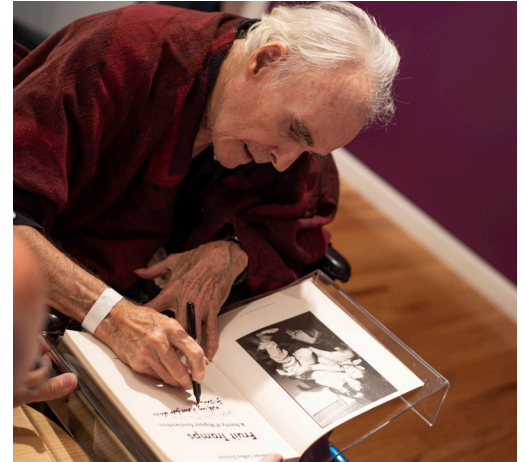
Photo journalist Herman LeRoy Emmet signing a copy of his “Fruit Tramps” photo essay in 1988 Life magazine