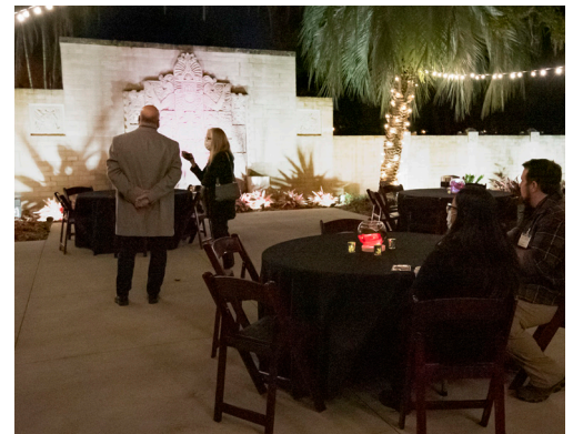
The new West Garden plaza all lit up!