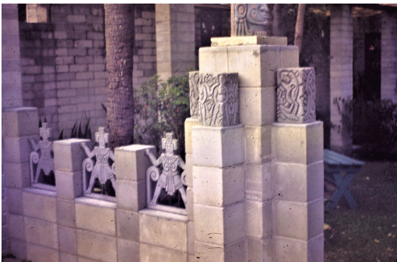
Small statues and sculptural pieces were often displayed in the Mayan Courtyard during the historical Research Studio years.