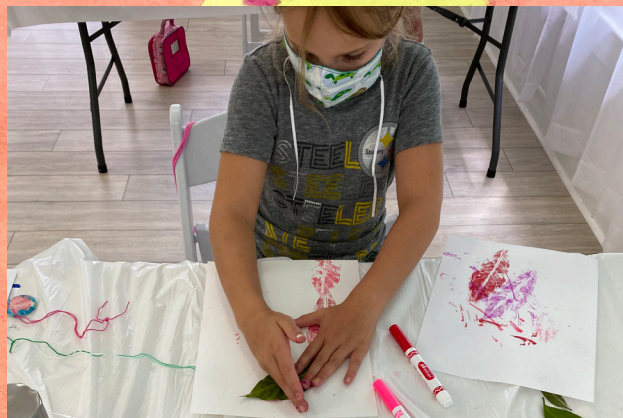
Student using natural materials to make prints