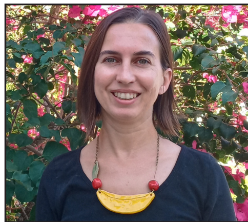
Wearing one of my pottery creations!