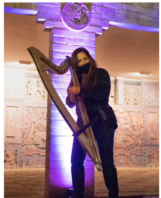
The Wandering Harpist