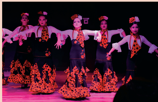
Flamenco del Sol performance.