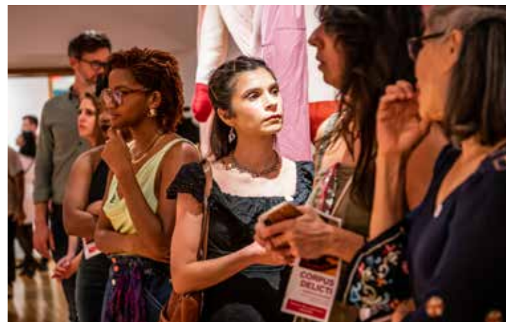
Gallery during exhibition opening