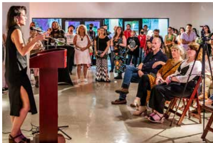
Artist talk at exhibition opening